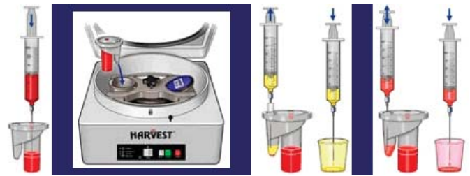
Figure 1. Isolation of PRP. Stage 1-Transferring whole blood into blood chamber. Stage 2-Load SmartPReP.® Stage 3-After processing, Platelet Poor Plasma (PPP) is isolate (Yellow). State 4-Then Platelet Rich Plasma (PRP) is isolated (red). Closed Syringe Harvest of Autologous Fat.

Figure 3 displays a female patient 1 year after autologous fat grafting with PRP to the nasolabial folds and lips. This patient continues to display marked rejuvenation in the areas noted. There continues to be noticeable improvements: continued fullness of the lips, some reduction of perioral rhytids, enhanced