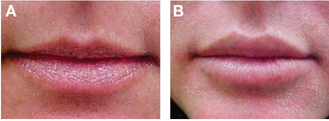
Figure 6. A: preoperative photograph. B: Patient at six months after autologous fat grafting with PRP to lips.

with an 8-week course of twice daily autologous platelet concentrate. Of the patients in the placebo group, only 2 of 13 their wounds displayed the same results. Upon crossover treatment of the placebo group with autologous platelet concentrate, all previously unresponsive wounds displayed re-epithelialization.