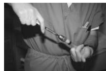
Figure 2. Addition of PRP Isolate to Graft Material.

Figure 7 shows a woman 2 years after autologous fat grafting to the breast. The patient displays a continued fullness. Although there was much improvement in breast fullness, she is receiving more fat graft for slightly larger breast at a second stage. Mammographies preoperatively, at 6 months, and then annually have revealed no abnormalities or cystic calcifications.