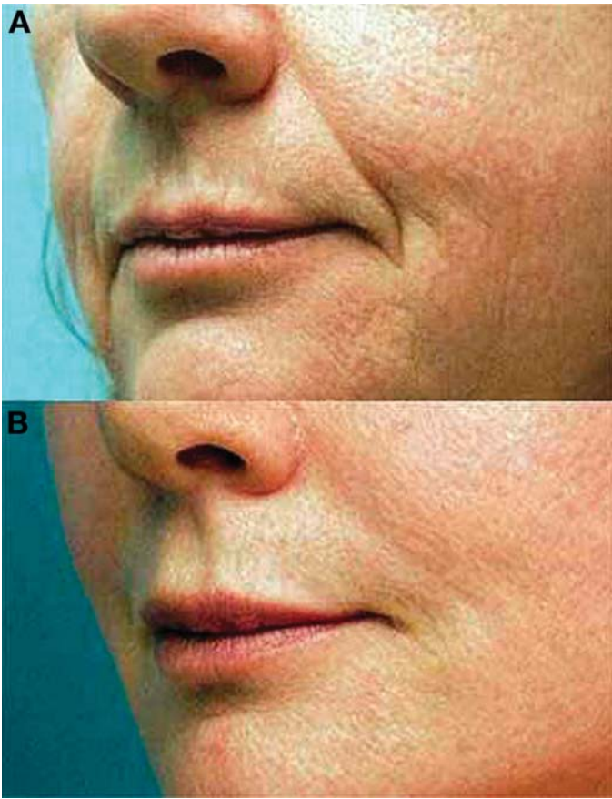
Figure 3. A: Preoperative photograph. B: One year after autologous fat grafting with PRP to nasolabial folds and lips.

Although the current results were based on qualitative, clinical findings, efforts are being set forth to further study the procedure from a quantitative, cellular level.