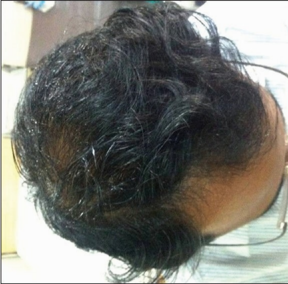
Post-treatment clinical photograph

Articles from Journal of Cutaneous and Aesthetic Surgery are provided here courtesy of Medknow Publications