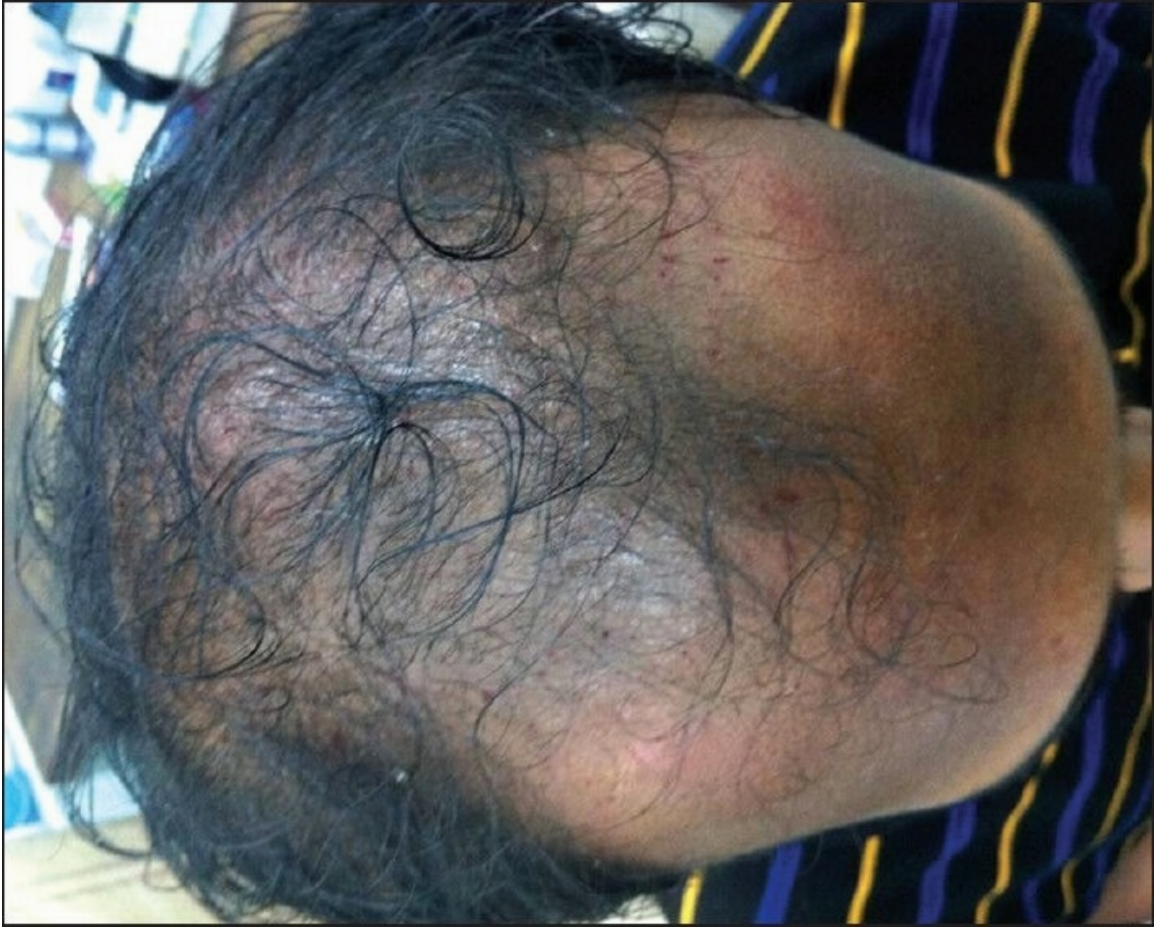
Pre-treatment clinical photograph